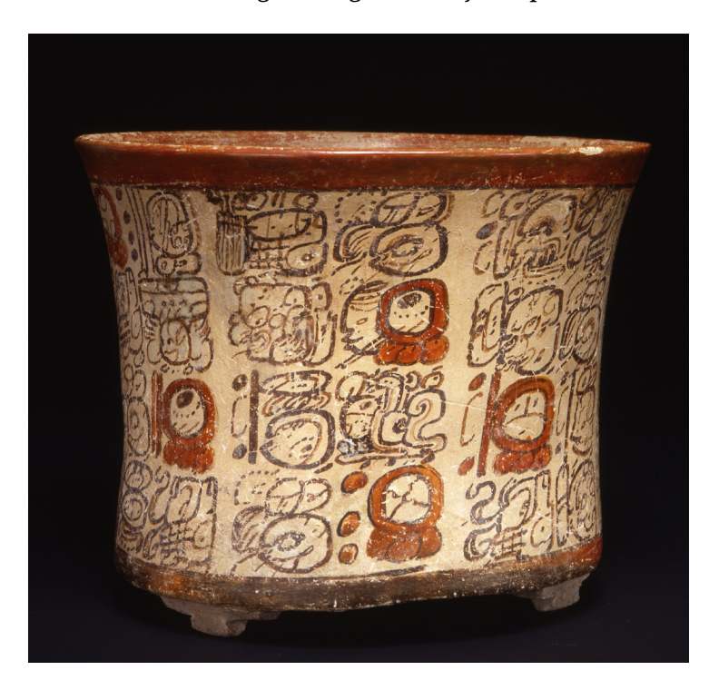
Fig. 5: Dynastic Vase, clay vessel, clay, polychrome paint, hieroglyph inscriptions, late classic period, 11,7 x 13,8 x 13,8 cm, 0,4 kg, Guatemala, Maya. IV Ca 50142, donation in 2003.

Robicsek was Hungarian by birth and a renowned cardiologist. Travelling in central America to offer medical services, he began to visit Maya sites and became an amateur researcher collecting, among other objects, pre-Columbian art.<sup>21</sup>