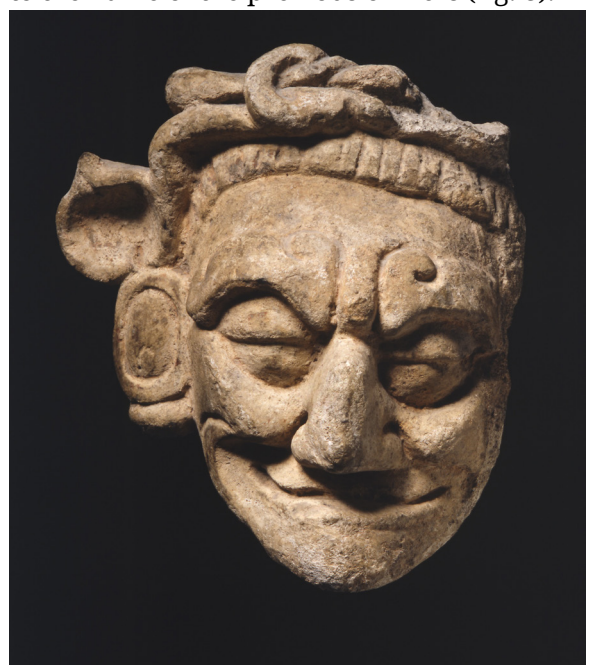
Fig. 8: Stucco mask, Jaguar god of the underworld , late classic period, 17,1 x 14,5 x 9 cm, Guatemala, Maya, IV Ca 50419, donation 6 July 2005.

Gift no. 23 from 6 July 2005 is the last example where the collector Zarnitz at least refers to the name of the previous owners (fig. 8). The stucco mask from Guatemala (IV Ca