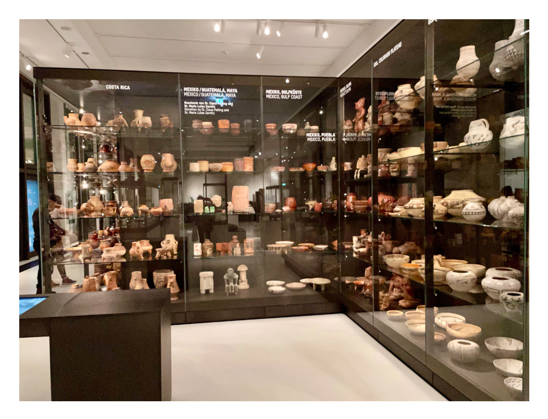
Fig. 3: Showcases in the Humboldt Forum Berlin with the presentation of the Pelling and Zarnitz collection, 2022.

These commitments recently informed the exhibition display of the Ethnologisches Museum in the new Humboldt Forum in the centre of Berlin. Even though the museum had repeatedly pointed out to the collectors that the acquisitions from the art trade were problematic from today's perspective, as implicitly resulting from illegal excavations and illegal export from countries of origin, the donors insisted on labelling in accordance with contractual obligations also in the Humboldt Forum (fig. 3).