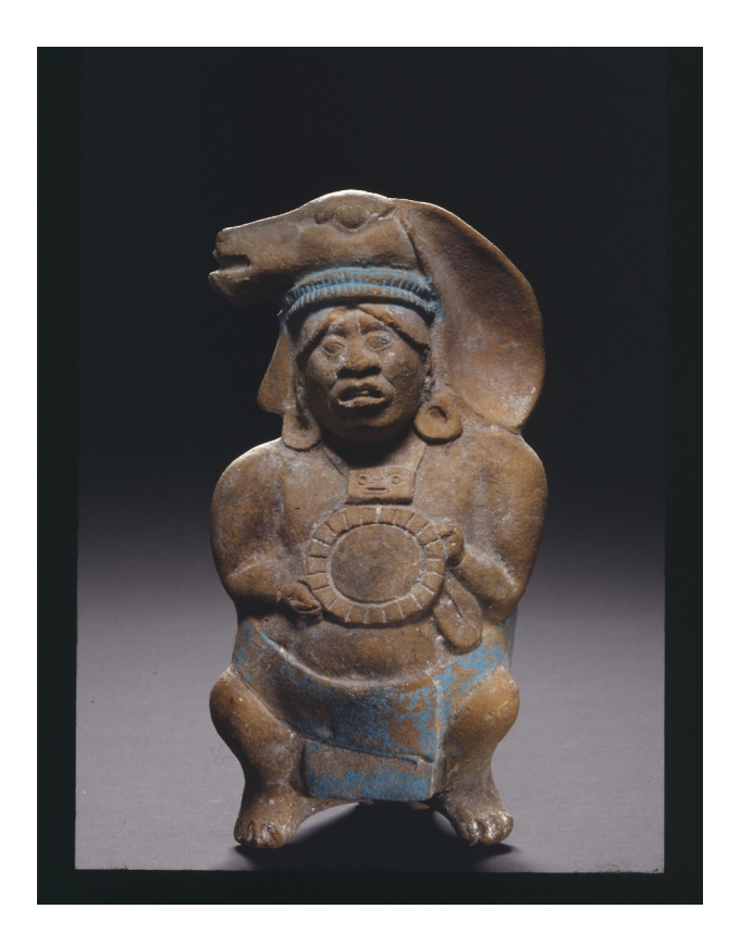
Fig. 7: Clay figure, Figure of a dwarf with mirror in the hands, blue paint, late classic period, 15.6 \times 8.1 \times 6.8 \text{ cm} , 0.32 kg, Mexico, IV Ca 50146, donation of 17 November 2004.

graves were professionally excavated or looted (...) the prolific ceramics and other media provide an encyclopedia of ancient life for art historians (...). (p. 201)". <sup>26</sup>