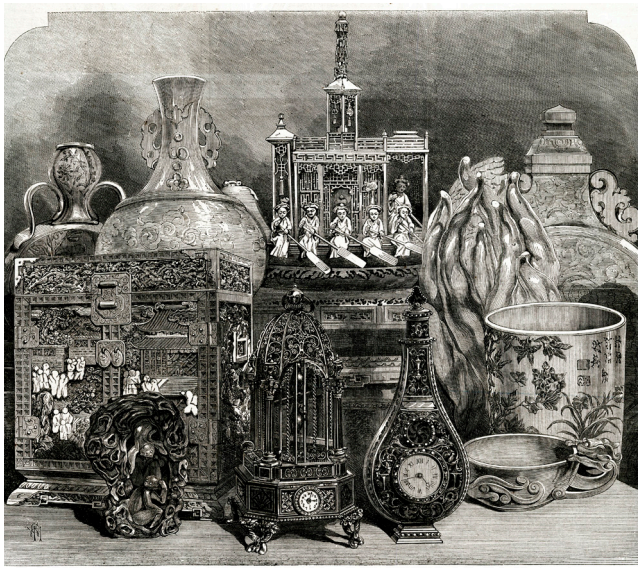
Fig. 2: “Articles in the Chinese Exhibition at the Crystal Palace”

The Illustrated London News reported thus: “An interesting collection of Chinese objects of rare beauty and great value...stated to be worth over £300,000”. 63 The Times opened in a similar vein: “...one of the most curious, and probably one of the most valuable, collections of the kind that has ever been seen in this country”. Negroni’s jade carvings were particularly noted. There were quantities of precious jewels, “...wonderful works in cameos, carved groups, and vases” of “rare beauty and...value”. The extraordinary size of the jewels were particularly remarked upon, the highlight being Negroni’s “monster sapphire” of 742 carats, claimed to be the “largest in the world”. The collection included luxurious furs and textiles, satins and embroideries, with porcelain said to be “the finest of its kind” ever brought to England. Negroni’s collection, The Times concluded, would surely “prove one of the most lasting attractions of this season”. 64