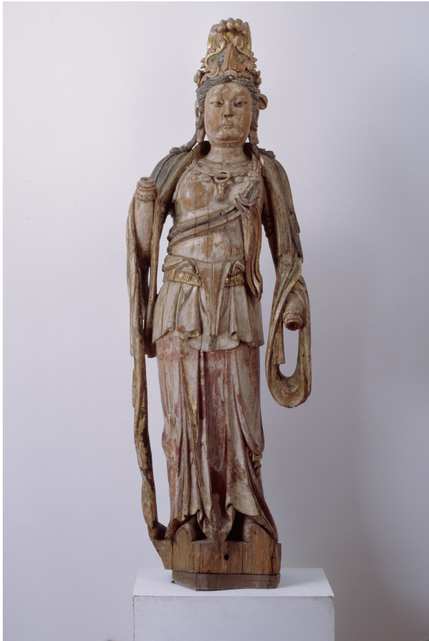
Fig. 8: Guanyin (Kuan-yin), late Liao- or Yuan period (twelfth to thirteenth century), wood, partially painted with traces of gold, 210 x 75 x 50 cm, Museum Fünf Kontinente, München, inv.no. 35-8-31 , © Museum Fünf Kontinente, Mari- anne Franke.

Concerns that more forgeries may be identified among the group of objects acquired at the Graupe auctions prompted some RFA-Tests and also several X-Ray examinations. 40 The results confirmed however that some of the bronze objects must at least have remained in the earth for a long period. Consequently, the circumstances of excavations made in the early twentieth century needed to be considered.