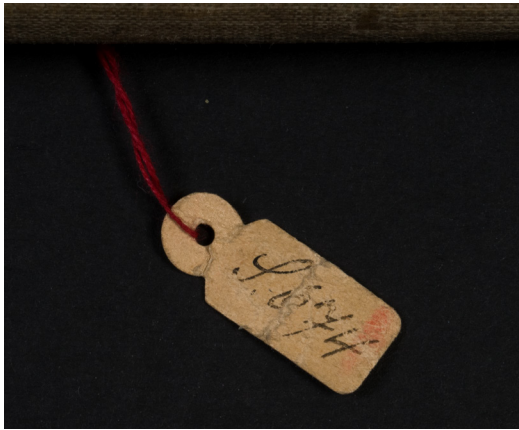
Fig. 2: Price label from the Dr Otto Burchard & Co GmbH, Berlin, 1920s, found on the Chinese scroll painting with calligraphy. Museum Fünf Kontinente, München, inv.no. 35-8-30