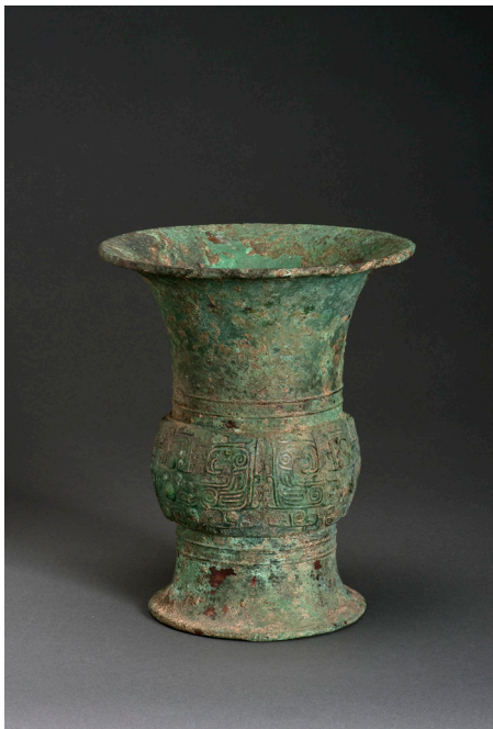
Fig. 9: Zun (Tsun), late 11th–early 10th century BC, Zhou Dynasty (Chou period) (1122-255 BC), bronze, height 24,5 cm Museum Fünf Kontinente, München, inv.no. 35-8-20 , © Museum Fünf Kontinente, Marietta Weidner.

case the RFA-Test could verify the old entry, and excavation descriptions were consulted. As Orvar Karlbeck had published his excavations in 1931, 42 he must have been the best source for information in 1935, even if it was reported second-hand by the collector Oeder. Very similar objects however have also been found in graves in Luoyang (Lo-Yang). 43 For a final verification identifying the correct excavation site one could compare the RFA analysis of the mask with other excavations from Guweicun (Ku-wei-ts'un) in the museums in Stockholm and Berlin. In his article Karlbeck also mentions that the masks were fixed to huge wooden segments of the grave construction. If the nails affixing them were made of iron this could explain the iron identified by the RFA analysis. Again, a comparison with other Taotie (tao-t'ieh) masks in the corresponding collections could help to clarify this part of the story.