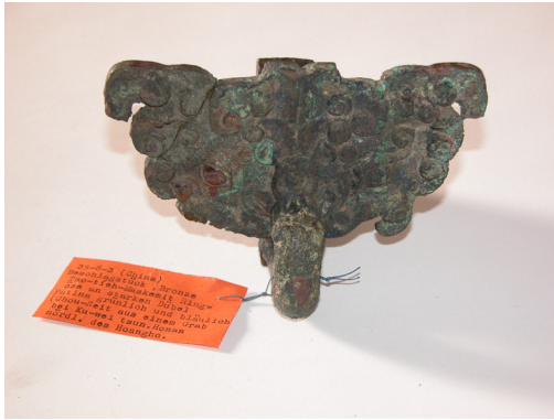
Fig. 11: Taotie (T'ao-t'ieh) Mask, Zhou Dynasty (Chou period) (1122-255 BC), bronze, greenish patina, partly encrusted, broken, 10 x 11,5 cm, Museum Fünf Kontinente, München, inv.no. 35-8-3

of enormous debts. 47 Furthermore, neither the finance authorities nor other Nazi authorities (unless they were buyers) were involved in the auctions.