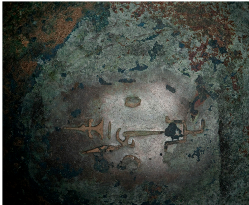
Fig. 10: Zun (Tsun), late 11th–early 10th century BC, Zhou Dynasty (Chou period) (1122-255 BC), bronze, height 24,5 cm Museum Fünf Kontinente, München, inv.nr. 35-8-20

From the above-mentioned examples it seems clear that from 1928 high prices were no longer sustainable and had to come down. As for the question whether prices achieved