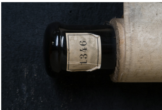
Fig. 5 Paul Graupe auction label, Berlin 1935, found on the Chinese scroll painting with calligraphy, Museum Fünf Kontinente, München, inv.nr.35-8-30

Traces on some of the scroll paintings show that art objects were sent from the Berlin firm to the New York subsidiary. On the Ming period scroll painting, Houseboat at Moonlight , painting on silk, 122x65 cm (inv.nr. 35-8-29, fig. 6) a great deal of information could be found, such as the big label with an ink inscription in English “No. 124 Last Ming Period, about 1600-1650 Anonymous/ A night in the houseboat at moon-light. Cut off on the left side” (fig. 7). The painting was obviously shown in one of the New York exhibitions of Dr Otto Burchard’s stock. Another inscription “734 [and an old price] 1,600” provides old prices and numbers from another, unknown exhibition.