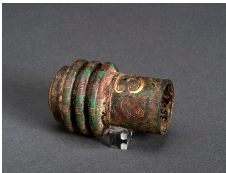
Fig. 12: Wheel hub, Han Dynasty (206 B.C.–220 A.D.), made of gold and silver tausia with embedded bone, length 18,2 cm, Museum Fünf Kontinente, München, inv.no. 35-8-5