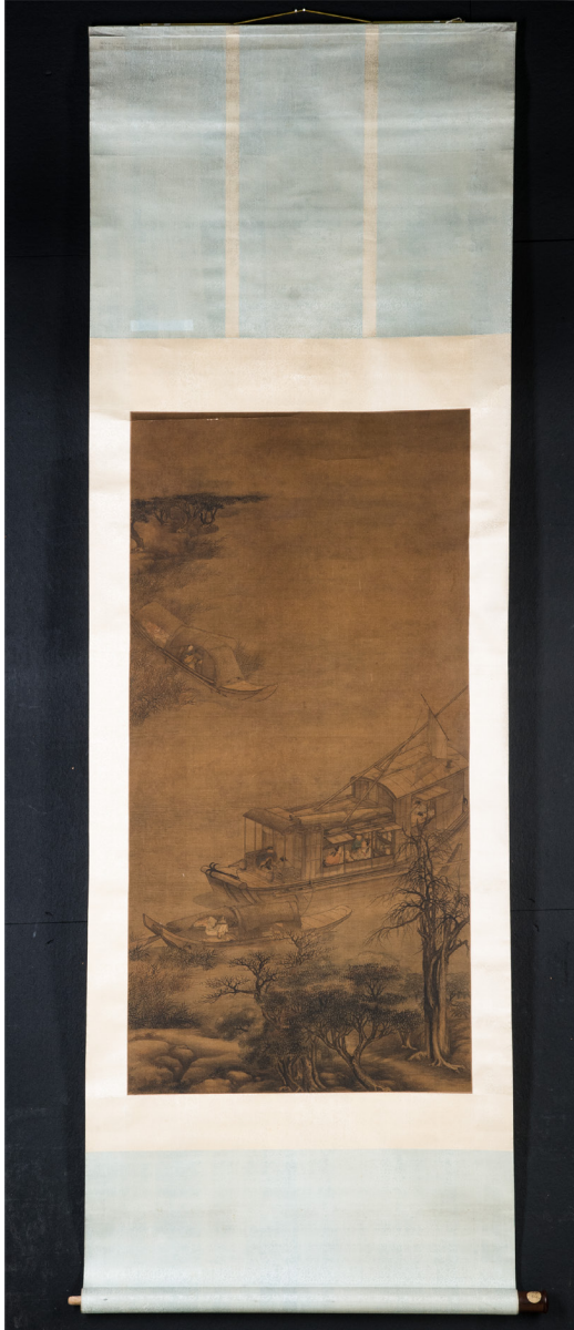
Fig. 6: Chinese scroll painting, Houseboat at moonlight , Ming Dynasty (1368–1644), painting on silk, 122 x 65 cm, Museum Fünf Kontinente, München, inv.no. 35-8-29, © Museum Fünf Kontinente, Marianne Franke.

In the case of the Zun (Tsun, a bronze beaker, inv.no. 35-8-20, from the Zhou (Chou) period the inventory book provides the following information: “Herr Burchard of the firm Dr Burchard told me that the bronze had cost 12,000 Reichsmark a few years ago,