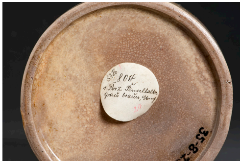
Fig. 4: Price label from the Dr Otto Burchard & Co GmbH, Berlin, 1920s, found on the cup for brushes, stoneware, 13cm high, Museum Fünf Kontinente, München, inv.no. 35-8-25