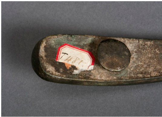
Fig. 3: Price label from the Dr Otto Burchard & Co GmbH, Berlin, 1920s, found on the bronze clasp, Han Dynasty (206 BC–220 AD), Museum Fünf Kontinente, München, inv.no. 35-8-8.

museum (now Museum Fünf Kontinente) was one of the buyers. Fortunately, it preserved its annotated catalogue of the March auction with numerous notes on single pieces, prices and other buyers. Comparisons of the estimates and the auction results for the March 1935 sale could be established on the basis of further annotated auction catalogues from the Museum für Kunst und Gewerbe in Hamburg and in the Museum Fünf Kontinente in Munich along with auction results in the Weltkunst Journal. They conveyed a strong sense of the “normalcy” of the auction, with some types of works selling for high prices, and others which may not have been fashionable at the time sold for lesser amounts. The overall total for the March 1935 Burchard sale had been estimated at 154,260 Reichsmark. The total proceeds of the sold lots turned out to be 135,235 Reichsmark. The difference amounts to 19,025 Reichsmark for a total of 597 lot numbers, with just 20 lots remaining unsold. 27 This does not suggest either a forced sale or a sale with depressed prices.